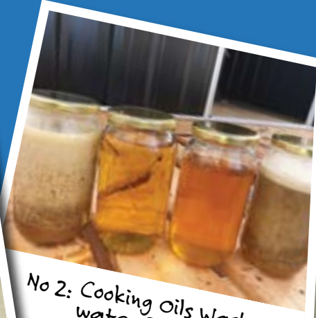
No 2: Cooking Oils Wash water Recovery