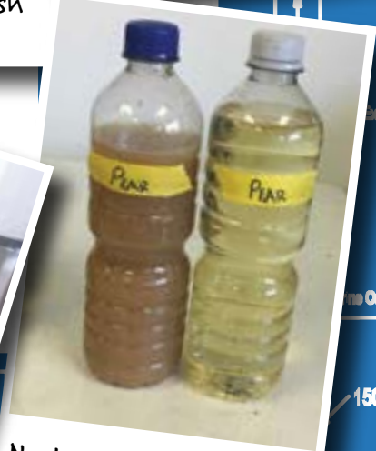
No 15: Pear Juice