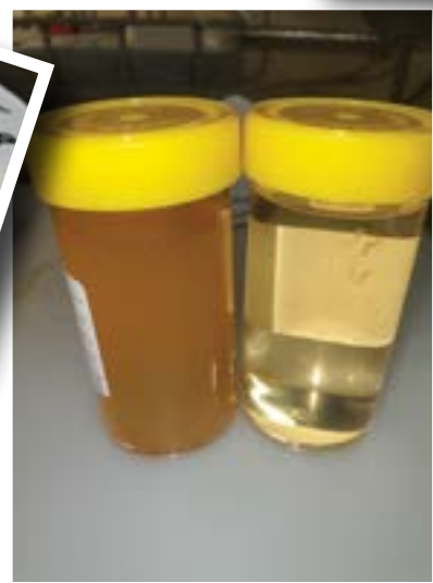
No 4: Gelatine Processing