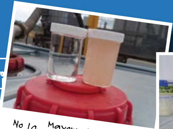
No 10: Mayonnaise Waste