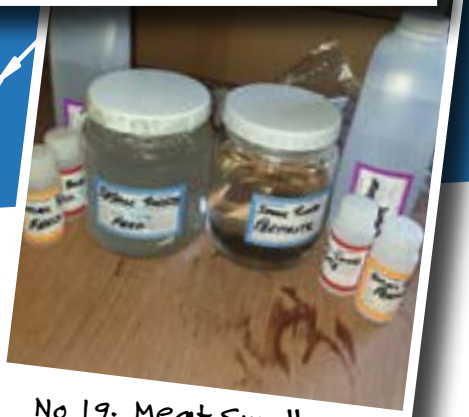
No 19: Meat Small Goods Wash Water Recovery