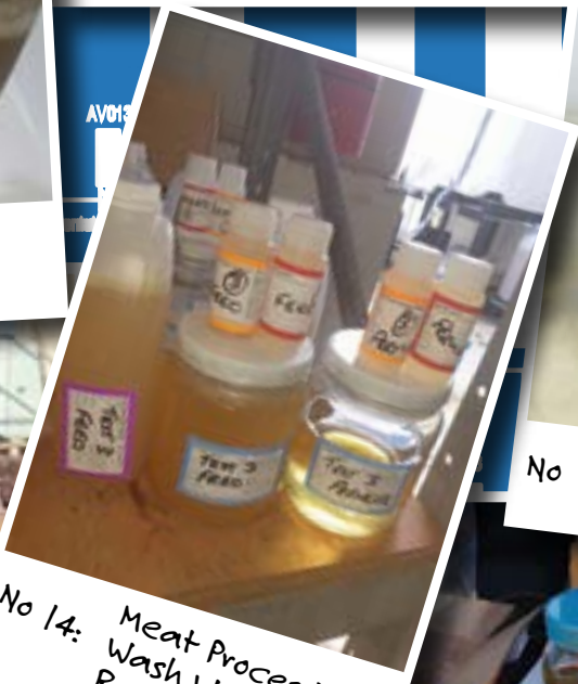
No 14: Meat Processing Wash Water Recovery