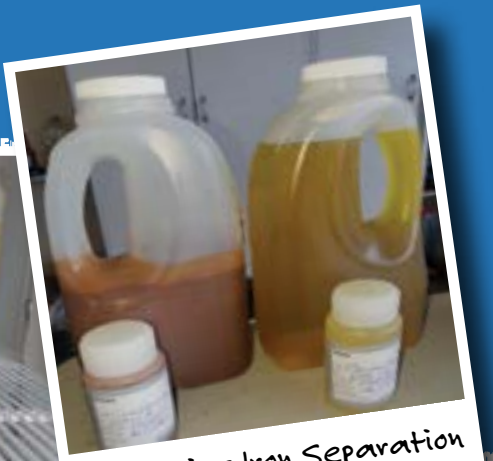
No 12: Zinc Iron Separation from Galvanisers