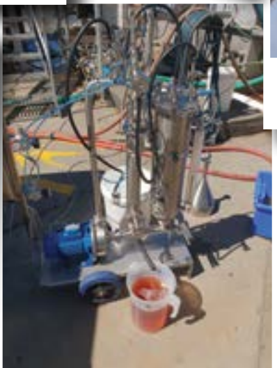
Pilot Plant Customer Site