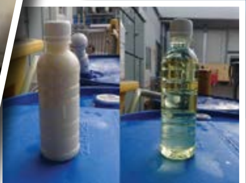
No 9: Dairy Waste