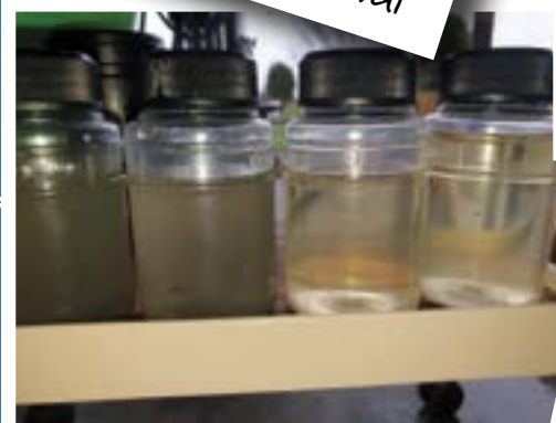
No 6: Machine Cutting Oils Recovery and Reuse