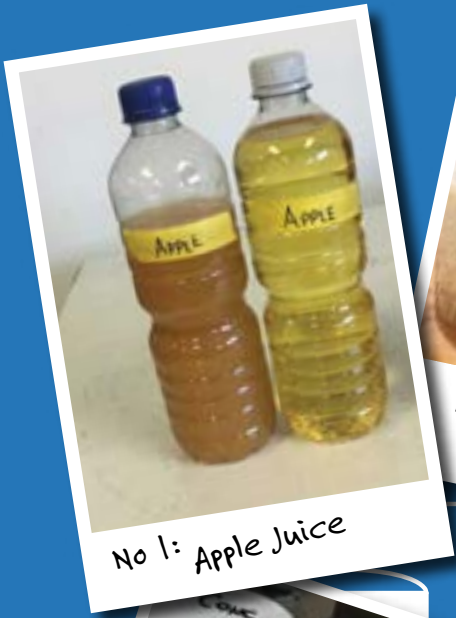
No 1: Apple Juice