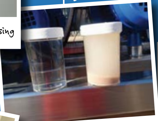
No 7: Baked Goods Waste