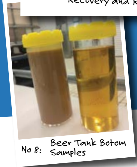
No 8: Beer Tank Bottom Samples