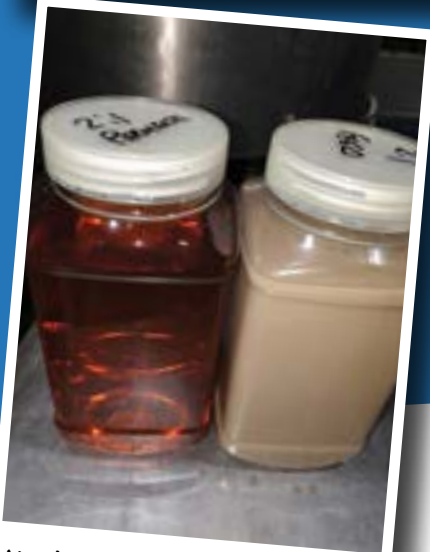
No 18: Wool Sour Oil removal