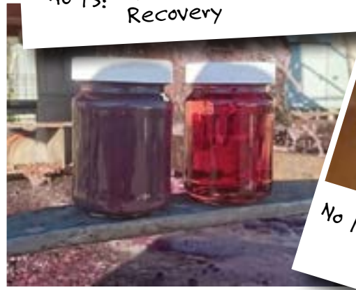
No 16: Winery Waste