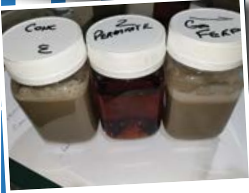
No 13: Wool Scour Water Recovery