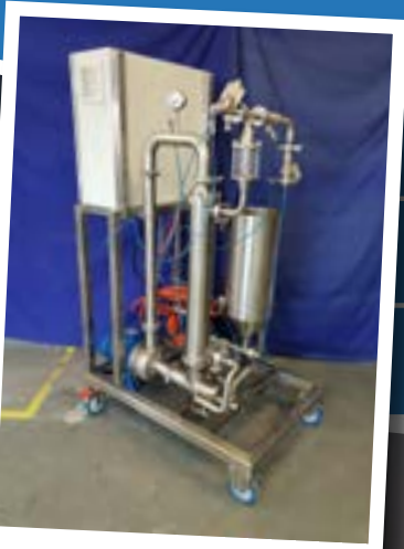
Large Pilot Plant