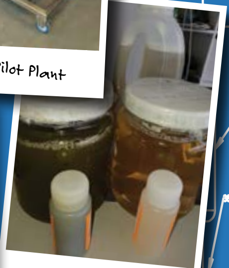
No 5: Animal Rendering Waste water