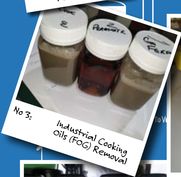
No 3: Industrial Cooking Oils (FOG) Removal