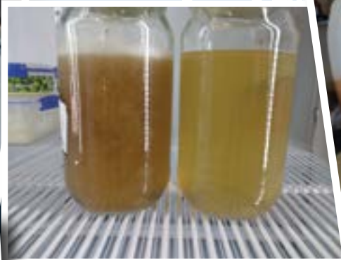
No 11: Potato Starch Wash Water Recovery